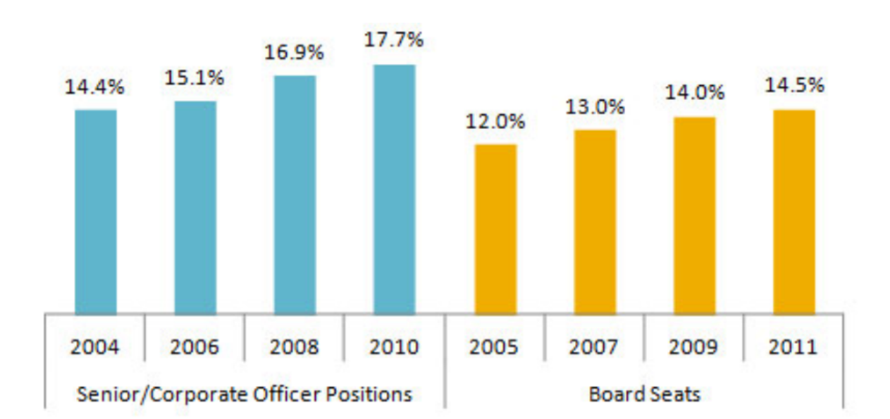
Figure 2: Women's Share of Financial Post500 Leadership Positions

The most prominent issues in the third wave of movement include eliminating racial and social discrimination (in reference to gender), fighting against gender violence, ensuring reproductive rights, and raising awareness to eliminate instances of rape. Other issues of this wave include the glass ceiling, the gender wage gap, sexual harassment, and unfair maternity leave policies. The third wave mainly focused on the intersection of gender and race in terms of discrimination. One of the biggest successes of the third wave was the Freedom Ride in 1992, an effort to register voters in poor minority communities, specifically focusing on young women (Taylor, 1999). Political activism was extremely common during the third wave of feminism, but even more emphasized than political activism was the individual women's empowerment to cause societal change. Many argue that the third wave of the feminist movement should not be acknowledged as it was merely an extension of the second wave of the movement, but others argue that the third wave of the movement continued from the early 1990s and is