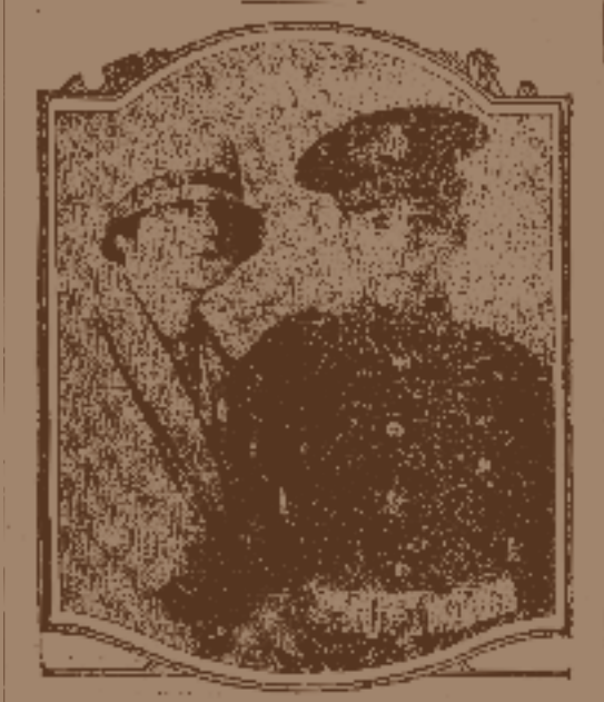
This attention who were with the British ways of an exciting on the British of the British of the British of the British of the British of the British of the British of the British of the British of the British of the British of the British of the British of the British of the British of the British of the British of the British of the British of the British of the British of the British of the British of the British of the British of the British of the British of the British of the British of the British of the British of the British of the British of the British of the British of the British of the British of the British of the British of the British of the British of the British of the British of the British of the British of the British of the British of the British of the British of the British of the British of the British of the British of the British of the British of the British of the British of the British of the British of the British of the British of the British of the British of the British of the British of the British of the British of the British of the British of the British of the British of the British of the British of the British of the British of the British of the British of the British of the British of the British of the British of the British of the British of the British of the British of the British of the British of the British of the British of the British of the British of the British of the British of the British of the British of the British of the British of the British of the British of the British of the British of the British of the British of the British of the British of the British of the British of the British of the British of the British of the British of the British of the British of the British of the British of the British of the British of the British of the British of the British of the British of the British of the British of the British of the British of the British of the British of the British of the British of the British of the British of the British of th

Marriages in Most Cases Prove Happy Between British Soldiers And German Women, Reports Reveal